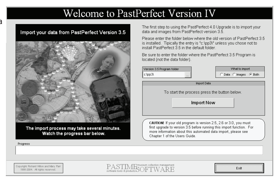
Figure 1-3 Import Data screen

You will need to specify the location of the old version 3.5 program. Usually the old program is located in c:\pp3\. However, if you have the program installed somewhere else, you will need to enter that folder name in this field.